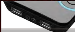
3 outputs including 5V 2A and 16-19V output, support notebook

5V 2A/1A selectable output, best fit for : iPad2 / iPad / Galaxy Tab / Tablet and More