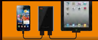
Dual USB 5V independent output ports

State-of-the-art circuit design, can be used as a universal power supply