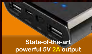
State-of-the-art powerful 5V 2A output

5V 2A input, charge the battery state-of-the-art input circuit design, the battery can be charged by computer or in the car.