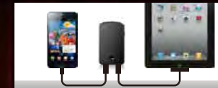
Dual USB 5V independent output ports

5V 2A input, charge the battery state-of-the-art input circuit design, the battery can be charged by computer or in the car.