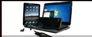
3 independent output ports

16~19V output for charging notebook computer